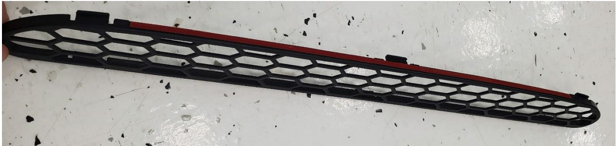
Figure 1: Adhesive applied to top of hood vent mesh

5 – Next, using the included adhesive roll, ③, place a strip along the bottom and top of the hood vent, ①, as shown in figures 1 and 2 below