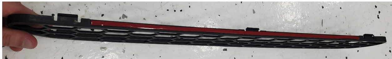
Figure 2: Adhesive applied to bottom of hood vent mesh

6 – Peel the backing off the applied adhesive and position the mesh along the rear of the hood scoop taking care to line up the clips with the body of the scoop