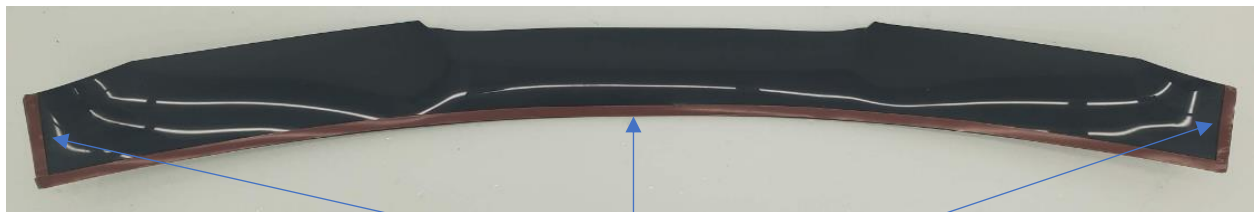
Pre-applied adhesive strips on the under side