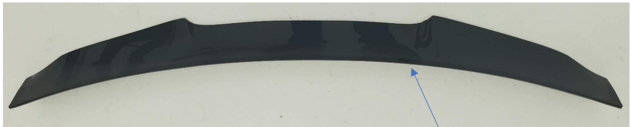
① - top side